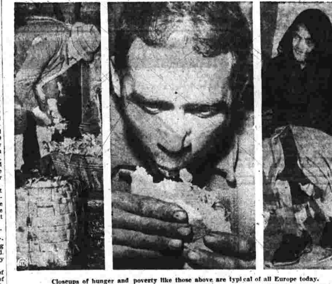
Claques of hunger and poverty like those above are typical of all Europe today.