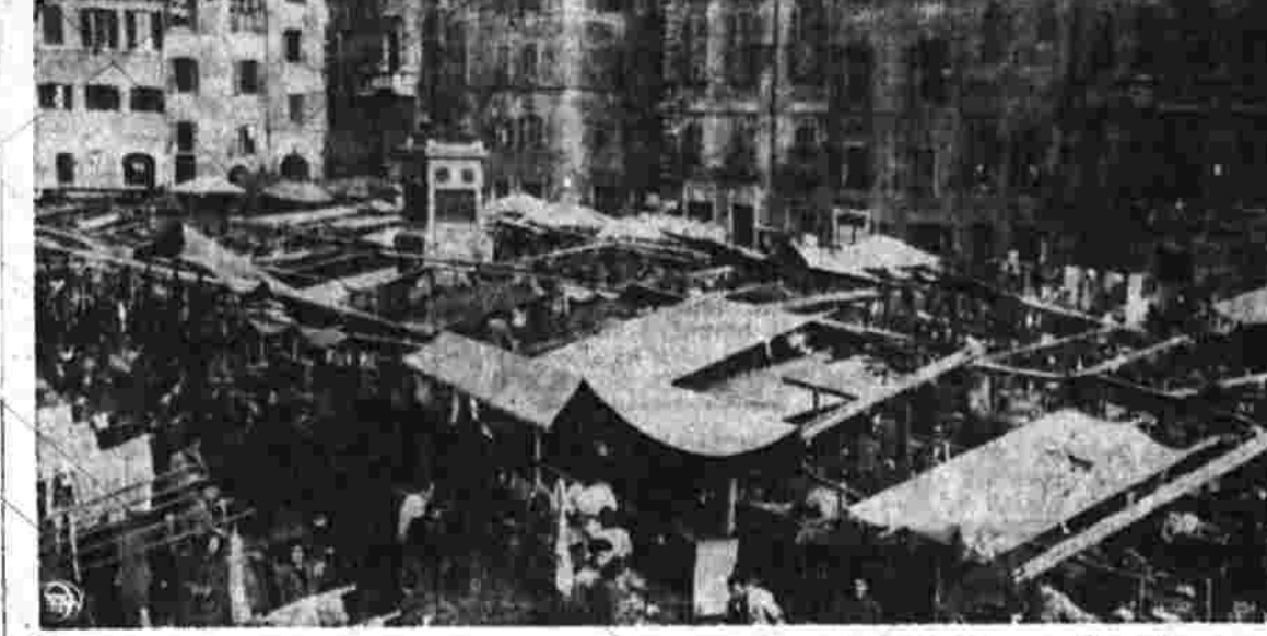
Housewives queue up waiting in vain to buy food in legal markets like the one shown in Rome in this picture.